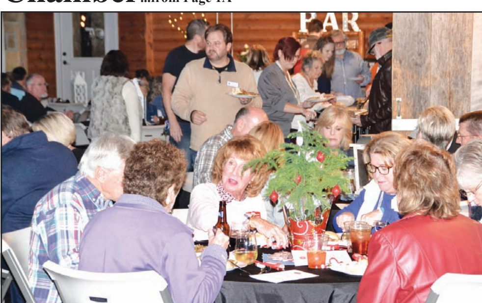
The "Denim & Pearls" annual meeting was well attended on Dec. 5 and featured impressive

statistics highlighting the importance of tourism to the area.